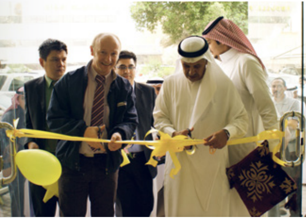
Inauguration of ParkerStore Dammam