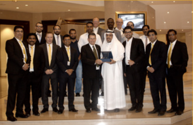
Celebrating the successful conclusion of Arabal 2015

Addamegh For Industrial Solutions, is the leading integrated Compressed Air Technologies “from Source to Exhaust” . Our success is driven by our professional staff and their commitments to get the best results from inception by operating with determination, executing with excellence, applying innovative technologies and capturing new opportunities.