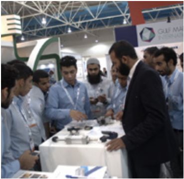
Product demonstration to a group of visitors

We are always located close to the heart of the industry, ensuring Parker products are available for quick delivery and are supported by first class technical backup.