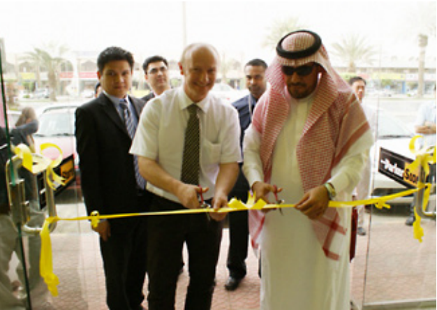
Inauguration of ParkerStore Riyadh